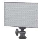
With blue filter