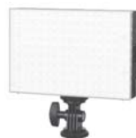
With extra soft diffuser