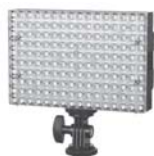
Without diffuser and filters