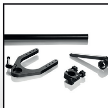
Camera Mount System