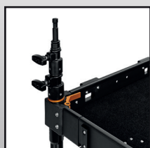
2-Stage Corner Mast Riser