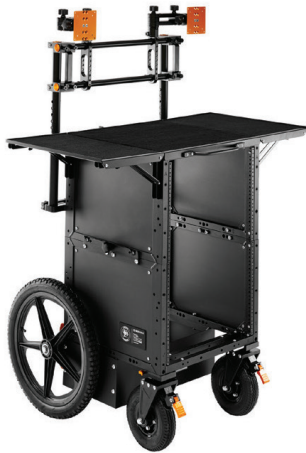
Deploy Gen IV with Insight Monitor Mounts