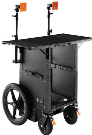
Deploy Gen IV with Two-Stage Riser