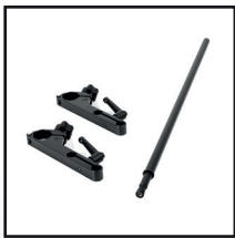
Baby Pin System