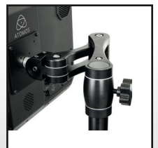
Boa Monitor Mount