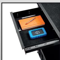
Top / Bottom Drawer