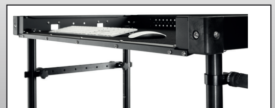
Also features the keyboard-friendly X-Top