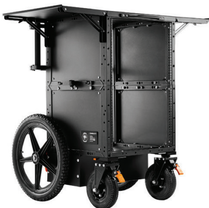
Deploy Gen IV

INOVATIV's Deploy is the cart with the small footprint. Based around a light-weight aluminium framed body, the latest version is about 20% lighter.