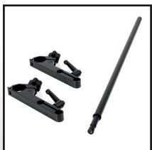
Baby Pin System