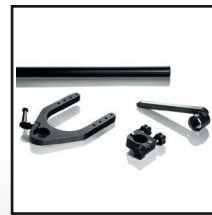
Camera Mount System