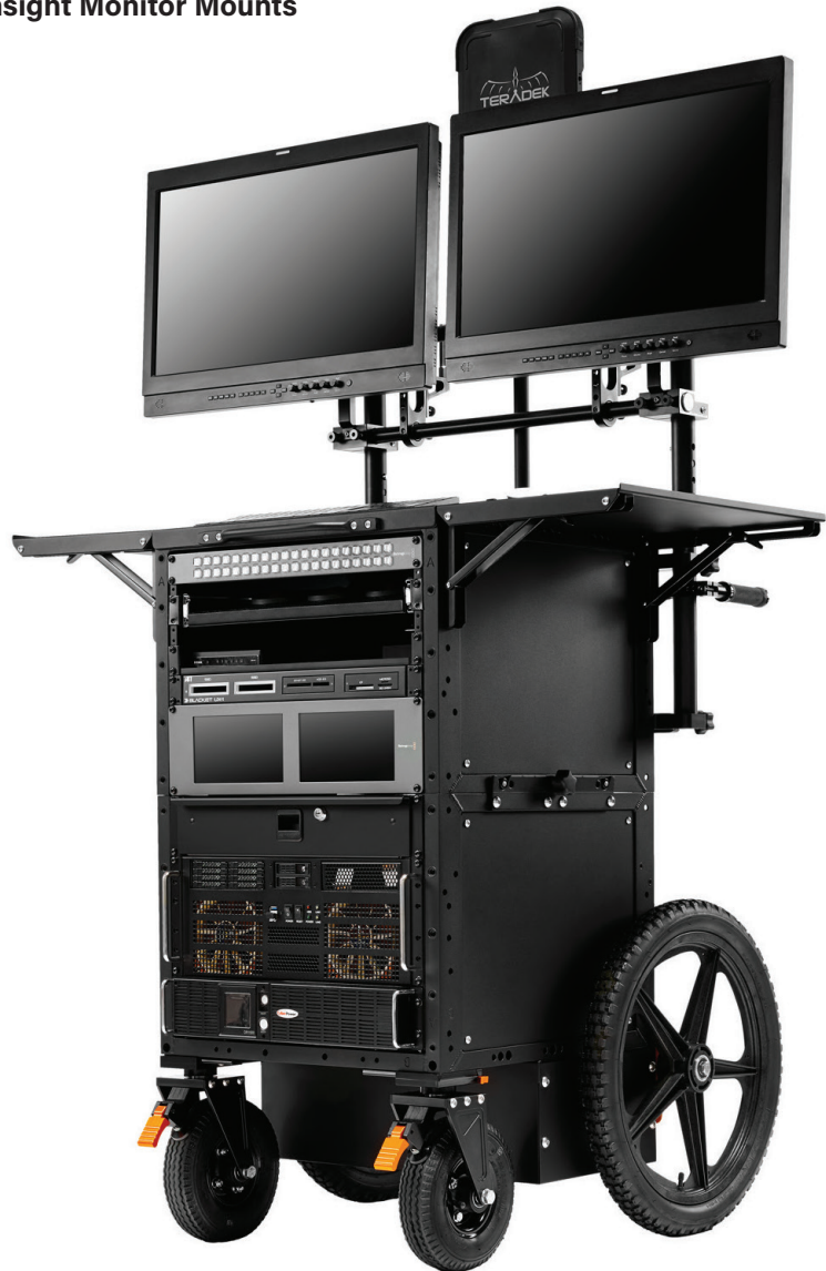
Deploy Gen IV with Insight Monitor Mounts