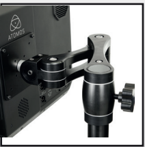
Boa Monitor Mount