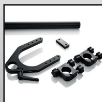
Camera Mount System