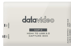
CAP-2 HDMI to USB 3.0 Capture Box