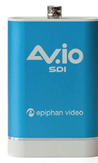
AV.io SDI 3.0 SDI to USB