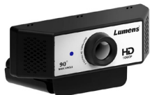
VC-B2U HD USB PTZ Camera with 12x zoom