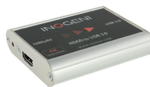
HD>>USB3.0 HDMI to USB 3.0 converter (HD)