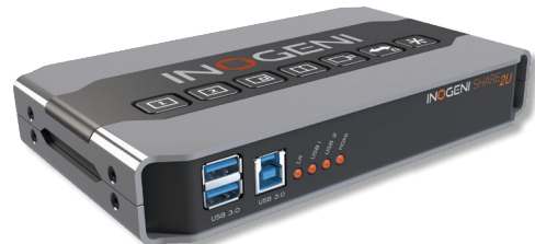
Share2U Dual USB + HDMI Video to USB 3.0