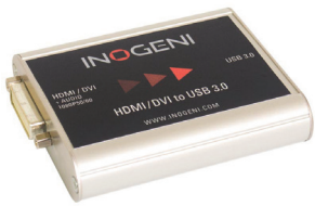
DVI>>USB3.0 HDMI/DVI-D to USB AV Converter