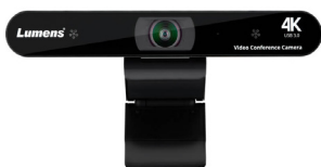
VC-B11U Video Conference Webcam