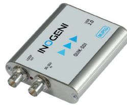
QUIK-SDI SDI capture to USB 2.0 MJPEG encoder