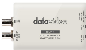
CAP-1 SDI to USB 3.0 Capture Box