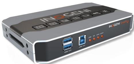
Share2 Dual HDMI/DVI Input to USB AV Converter with PiP