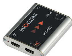
4KXUSB3 4K Ultra HD to USB 3.0 with HDMI loop