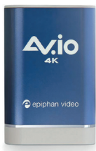
AV.io 4K 3.0 HDMI to USB (4K)