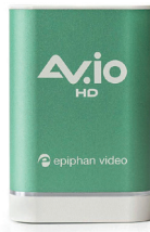
AV.io HD 3.0 DVI to USB