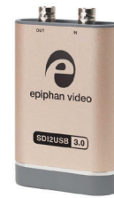
SDI2USB 3.0 SDI to USB