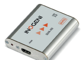
QUIK-HD HDMI capture to USB 2.0 MJPEG encoder