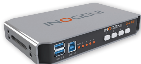
CAM 300 Switch between 4x USB and HDMI sources >> to USB output