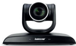
VC-B30U HD USB PTZ Camera with 12x zoom