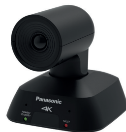
AW-UE4 Wide Angle 4K PTZ Camera with IP Streaming

Both Panasonic cameras feature USB, IP and HDMI outputs so they can be used for UC, lecture capture, video production or live streaming.