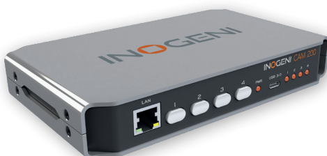
CAM 200 Switch between 4x HDMI and VGA sources >> to USB 3.0 connection