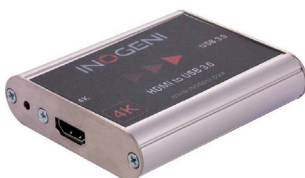
4K>>USB3.0 4K HDMI Capture to USB