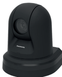
AW-HE38 Pan and tilt camera with 20x zoom