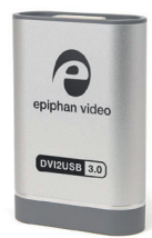
DVI2USB 3.0 DVI to USB 3.0