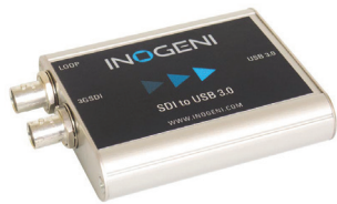
SDI >> USB3.0 3G-SDI to USB AV Converter