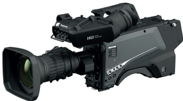
Panasonic's HC3900 studio camera delivers stunning HDR pictures in all lighting conditions.