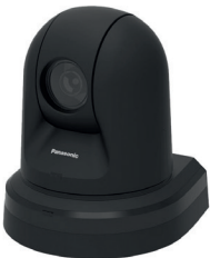
Panasonic's AW-HE40 PTZ camera has a 30x zoom and can follow quick moving sports.

It is essential to identify equipment that is reliable, easy to install, simple to operate and produces first-rate results. With mature HD workflows and robotically controlled cameras, even minimal staff can create superb sports programming.