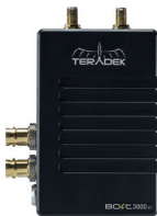
With Teradek Bolt, cameras can go live pitchside for interviews without a single trailing wire.