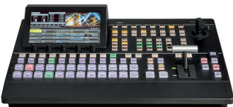
Panasonic UHS500 HDR switcher is compact and very durable