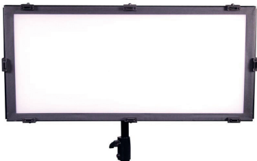
Light your own studio with high performance, cost-effective LED lights from LEDGO.