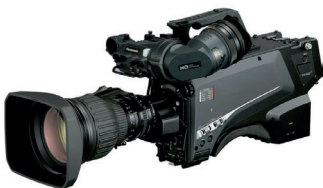
Panasonic UC4000 studio camera delivers great 4K images