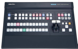
Datavideo SE3200 an easy to use 12-channel video mixer

It is essential that cameras can perform in all lighting conditions while production equipment must enable the director to share their artistic vision.