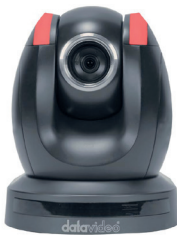
Datavideo PTC-150 delivers great HD pictures at a low price