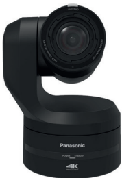
Panasonic UE150 is a new generation large sensor 4K camera for great low light performance