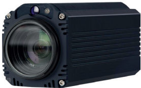
Installing Datavideo BC80 block cameras to shoot every angle