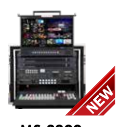
MS-3200 12 Input Flyaway Studio