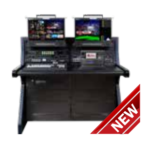
OBV-3200 12 Input HD OB Van Studio