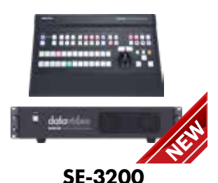
12 Input HD Switcher