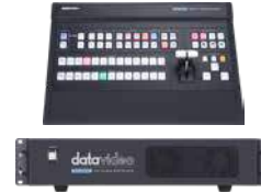
SE-3200 12 Input 1080p60 Switcher