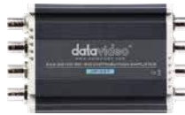
VP-597 2x6 3G-SDI Splitter