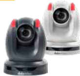
PTC-300NDI 20x NDI 4K Camera