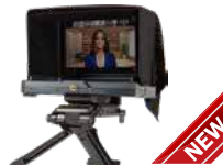
TTL-100 Through the Lens Kit