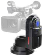
PTR-10/10T MARK II Robotic Pan Tilt Head