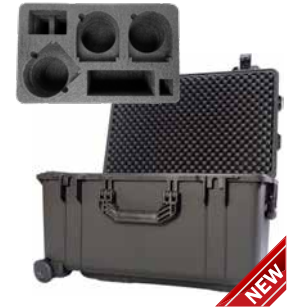
HC-800FS Water, Dust and Crush Resistant Case with foam compatible with PTC-280, PTC-140T and PTC-150TL - Trolley Style (XXL)