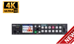
HDR-2 4K H.265 Recorder