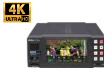
HDR-80 ProRes 4K Dual Disk Recorder Desktop