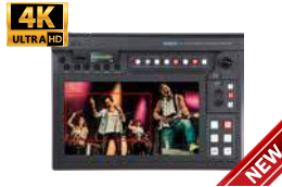
KMU-300 4K Multi-Channel ROI Streaming Switcher