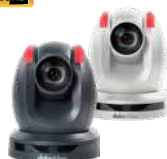
PTC-280NDI 12x NDI 4K Camera