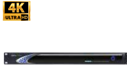
KMU-100 2 Input 4K Virtual Multicamera Processor