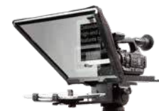
TP-650 Large Screen Prompter Kit for ENG Cameras