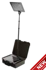
TP-800 Portable Conference Teleprompter