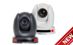
PTC-145NDI 20x 1080P Tracking Camera