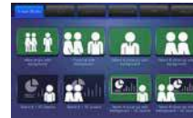
Control for OBV/MS/HS/SE-3200 Switcher: