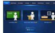
Control for DVK-400 4K Chromakey: