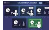
Control for VGB-2000/4000 Professional presentation system: