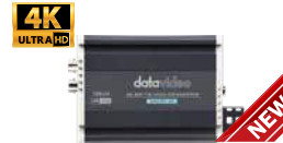
DAC-8P 4K 4K SDI to HDMI