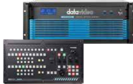
TVS-3000 4K AR 3D Tracking & Trackless