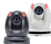
PTC-150 30x 1080P Camera