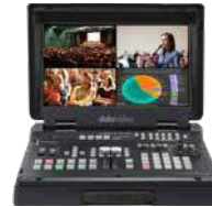
HS-1600T MARK II