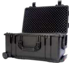
HC-700 Water, Dust and Crush Resistant Case - Trolley Style (XL)