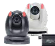
PTC-150T 30x 1080P HDBaseT Camera