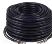
CB-24 SD 100m 3-in-1 Cable (SDI/ITC/CVBS)