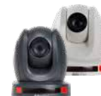
PTC-145 20x HD Tracking PTZ Camera