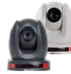
PTC-140T 20x 1080P HDBaseT Camera