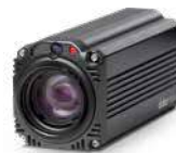
BC-80 30x 1080P Camera