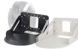
WM-1 Wall Mount for PTC Camera