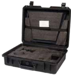
HC-600 Hard Case for TP-600/650 Teleprompter Kit