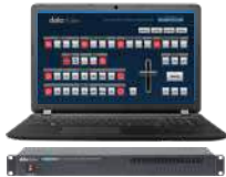
SE-1200MU 6 Input HD Switcher