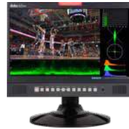
TLM-170V/VM/VR 17" ScopeView Monitor