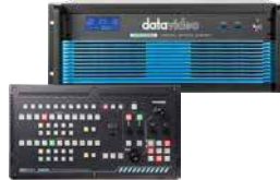
TVS-2000A 3D 2 Input 3G-SDI Tracking & Trackless