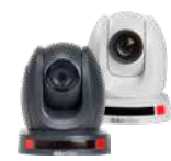
PTC-140NDI 20x NDI PTZ Camera