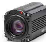
BC-50 20x 1080P Camera with Streaming Encoder