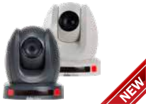
PTC-145T 20x 1080P Camera