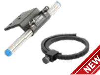
ZEK-2 Zoom Control Kit for Tilta Nucleus-M Motor