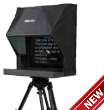
TP-900 Presentation Prompter for PTZ Camera