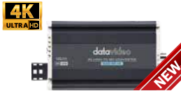
DAC-9P 4K 4K HDMI to SDI