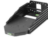
WM-11 Professional Wall Mount for Robotic Pan Tilt Head