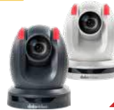
PTC-285 12x 4K Tracking Camera