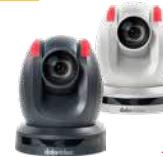
PTC-285NDI 12x NDI 4K Tracking Camera