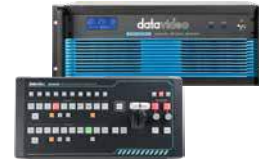
TVS-1000A 2D 1 Input HDMI Trackless