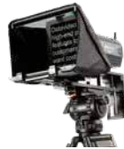
TP-300 Tablet Prompter