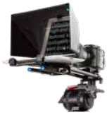
TP-500 DSLR Prompter