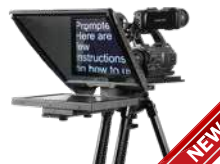
TP-700 Presentation Prompter for ENG Camera