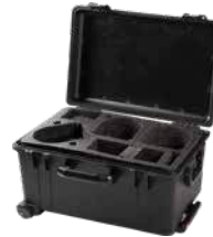
HC-800 Water, Dust and Crush Resistant Case - Trolley Style (XXL)