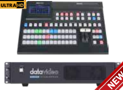
SE-4000 4K 8-Channel Digital Video Switcher