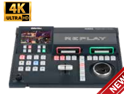
RPL-100 Prores Replay System