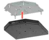
CM-10 Professional Ceiling Mount for Robotic Pan Tilt Head