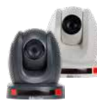
PTC-140 20x 1080P Camera