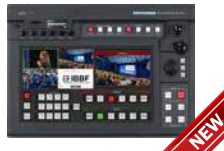
SHOWCAST 100 4K ShowCast Studio