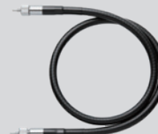
Flexible Cable CFC-12-990