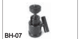
BH-07 Camera ball head for DN-60A