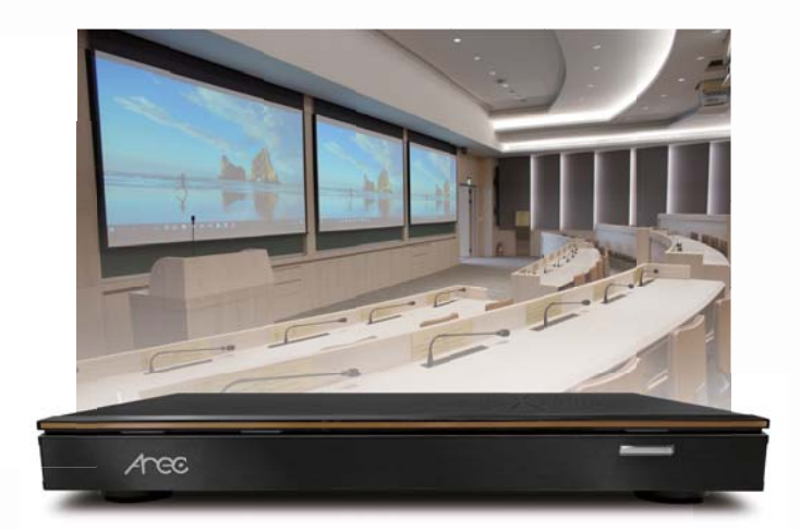
* The third party conference microphone system should support these features.

AREC DS-4CU can be integrated with the compatible third-party conference microphone system and existing audio visual equipment in the meeting room via API command. AREC Speaker Tracking System is simple to set-up, making conference and meeting recording more productive and smart.